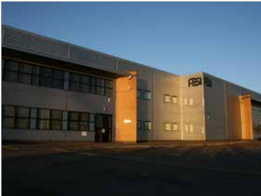
GPT St. Neots, UK