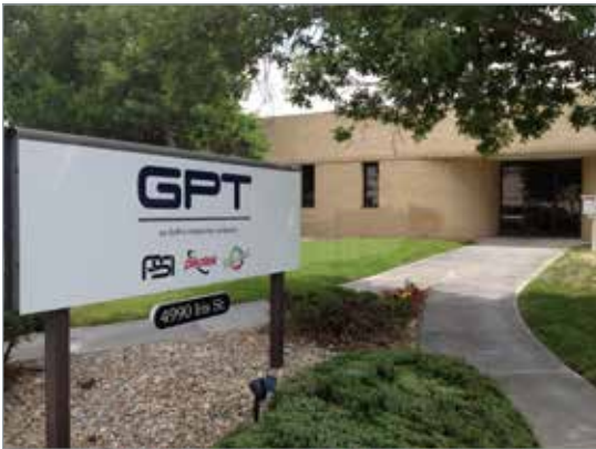
GPT Wheat Ridge, Colorado

At GPT we are committed to manufacturing and supplying only reliable, high-quality products that exceed our customers' requirements and expectations.