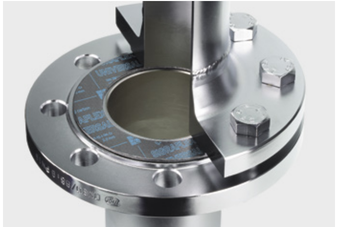
↑ Flange with SIGRAFLEX UNIVERSAL gasket