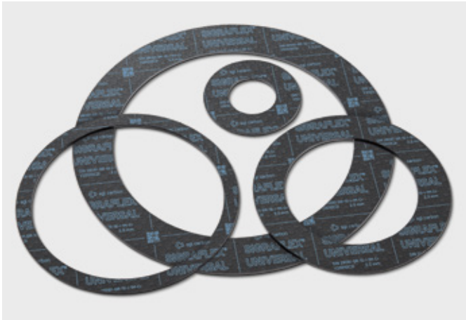
↑ Gaskets made from SIGRAFLEX UNIVERSAL